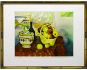
40: Paul Cezanne (1839-1906), Lithograph

Vincent Van Gogh (1853-1890), Ceramic Print Issued by: Royal Copenhagen Frame Size: 26 1/2 by 21 in. (67 by 53cm.) All measurements are approximate. Vincent van Gogh, in full Vincent Willem van Gogh, (born March 30, 1853, Zundert, Netherlands-died July 29, 1890, Auvers-sur-Oise, near Paris, France), Dutch painter, generally considered the greatest after Rembrandt van Rijn, and one of the greatest of the Post-Impressionists. The striking colour, emphatic brushwork, and contoured forms of his work powerfully influenced the current of Expressionism in modern art. Van Gogh's art became astoundingly popular after his death, especially in the late 20th century, when his work sold for record-breaking sums at auctions around the world and was featured in blockbuster touring exhibitions. In part because of his extensive published letters, van Gogh has also been mythologized in the popular imagination as the quintessential tortured artist. WE DO NOT GIVE ANY REPRESENTATION, WARRANTY, OR GUARANTEE OR ASSUME ANY LIABILITY OF ANY KIND IN RESPECT OF ANY LOT WITH REGARD TO MERCHANTABILITY, FITNESS FOR A PARTICULAR PURPOSE, DESCRIPTION, SIZE, QUALITY, CONDITION, ATTRIBUTION, AUTHENTICITY, RARITY, IMPORTANCE, MEDIUM, PROVENANCE, EXHIBITION HISTORY, LITERATURE, OR HISTORICAL RELEVANCE.