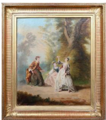
63: Unknown Author, Oil Painting

Pablo Ruiz Picasso (1881-1973), Oil Painting Signed (lower left) Image Size: 39 by 27 1/2 in. (98 by 69cm.) All measurements are approximate. Pablo Ruiz Picasso born (1881-1973) was a Spanish painter and sculptor. He is considered one of the greatest artists of the 20th century. His full name is Pablo Diego Jose Francisco de Paula Juan Nepomuceno Maria de los Remedios Cipriano de la Santisima Trinidad Clito Ruiz y Picasso. He is best known as the co-founder of cubism. Cubism is when the artist breaks up objects and re-assembles them in abstract and geometric form. Pablo Picasso created over 20,000 pictures. Picasso could draw and paint when he was very young. His first word was lapiz, the Spanish word for pencil. Perhaps his most famous painting is Guernica which shows the horrors of war after the bombing of the town of Guernica. He was 90 years old when a number of his works were shown in an exhibition at the Louvre in Paris. He was the first living artist to have an exhibition at the Louvre. Picasso had four children with three women. He died of heart failure on 1973. WE DO NOT GIVE ANY REPRESENTATION, WARRANTY, OR GUARANTEE OR ASSUME ANY LIABILITY OF ANY KIND IN RESPECT OF ANY LOT WITH REGARD TO MERCHANTABILITY, FITNESS FOR A PARTICULAR PURPOSE, DESCRIPTION, SIZE, QUALITY, CONDITION, ATTRIBUTION, AUTHENTICITY, RARITY, IMPORTANCE, MEDIUM, PROVENANCE, EXHIBITION HISTORY, LITERATURE, OR HISTORICAL RELEVANCE.