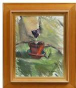
22: Unknown Author, Oil Painting

Claude Monet (1840-1926), Sketch on Paper Signed (lower right) Image Size: 12 by 9 in. (30.3 by 22.6cm.) All measurements are approximate. Claude Oscar Monet was a French impressionist painter who brought the study of the transient effects of natural light to its most refined expression. Monet was born on 1840, in Paris, but he spent most of his childhood in Le Havre. There, in his teens, he studied drawing; he also painted seascapes outside with the French painter Eugene Louis Boudin. By 1859 Monet had committed himself to a career as an artist and began to spend as much time in Paris as possible. During the 1860s he was associated with the preimpressionist painter Edouard Manet, and with other aspiring French painters destined to form the impressionist school. WE DO NOT GIVE ANY REPRESENTATION, WARRANTY, OR GUARANTEE OR ASSUME ANY LIABILITY OF ANY KIND IN RESPECT OF ANY LOT WITH REGARD TO MERCHANTABILITY, FITNESS FOR A PARTICULAR PURPOSE, DESCRIPTION, SIZE, QUALITY, CONDITION, ATTRIBUTION, AUTHENTICITY, RARITY, IMPORTANCE, MEDIUM, PROVENANCE, EXHIBITION HISTORY, LITERATURE, OR HISTORICAL RELEVANCE.