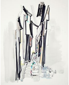
27: Wu Guanzhong (1919-2010), Ink with Watercolor on Paper

Yoshitomo Nara (B.1959), Lithograph Signed (lower right) Image Size: 20 by 19 1/2 in. (50 by 49cm.) All measurements are approximate. Yoshitomo Nara (B. 1959) is a Japanese artist. He lives and works in Nasushiobara, Tochigi Prefecture, though his artwork has been exhibited worldwide. Nara has had nearly 40 solo exhibitions since 1984. His art work has been housed at the MoMA and the Museum of Contemporary Art, Los Angeles (LACMA). His most well-known and repeated subject is a young girl with piercing eyes. WE DO NOT GIVE ANY REPRESENTATION, WARRANTY, OR GUARANTEE OR ASSUME ANY LIABILITY OF ANY KIND IN RESPECT OF ANY LOT WITH REGARD TO MERCHANTABILITY, FITNESS FOR A PARTICULAR PURPOSE, DESCRIPTION, SIZE, QUALITY, CONDITION, ATTRIBUTION, AUTHENTICITY, RARITY, IMPORTANCE, MEDIUM, PROVENANCE, EXHIBITION HISTORY, LITERATURE, OR HISTORICAL RELEVANCE.