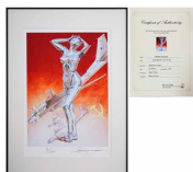
53: Hajime Sorayama (B.1947), Offset Lithograph