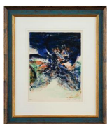
88: Zao Wou-Ki (1920-2013), Lithograph