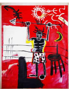
43: Jean-Michel Basquiat (1960-1988), Acrylic Painting

John Opie (1761-1807), Oil Painting Image Size: 23 1/2 by 29 in. (59 by 73cm.) All measurements are approximate. John Opie (1761-1807) was a renowned British painter, celebrated for his portrait and historical works. Often dubbed "the English Caravaggio," Opie's distinct style showcased his mastery of light and shadow, as well as his keen insight into human emotion. WE DO NOT GIVE ANY REPRESENTATION, WARRANTY, OR GUARANTEE OR ASSUME ANY LIABILITY OF ANY KIND IN RESPECT OF ANY LOT WITH REGARD TO MERCHANTABILITY, FITNESS FOR A PARTICULAR PURPOSE, DESCRIPTION, SIZE, QUALITY, CONDITION, ATTRIBUTION, AUTHENTICITY, RARITY, IMPORTANCE, MEDIUM, PROVENANCE, EXHIBITION HISTORY, LITERATURE, OR HISTORICAL RELEVANCE.