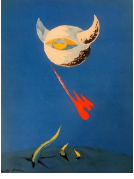
74: Andre Masson (1896-1987), Lithograph