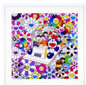
18: Takashi Murakami (B.1962), Offset Lithograph

Kazuo Shiraga (1924-2008), Gouache Painting Signed (lower right) Image Size: 16 1/2 by 13 in. (41.5 by 32cm.) All measurements are approximate. Kazuo Shiraga (1924-2008) was a Japanese painter and performance artist, born in Amagasaki, Japan. He was born in Amagasaki City, Japan. His early works of art were in the form of performance art, but later he was influenced by American abstract art and created a unique art technique called "foot painting". He often sees his art creation as a "momentary choice between life and death" of his body. WE DO NOT GIVE ANY REPRESENTATION, WARRANTY, OR GUARANTEE OR ASSUME ANY LIABILITY OF ANY KIND IN RESPECT OF ANY LOT WITH REGARD TO MERCHANTABILITY, FITNESS FOR A PARTICULAR PURPOSE, DESCRIPTION, SIZE, QUALITY, CONDITION, ATTRIBUTION, AUTHENTICITY, RARITY, IMPORTANCE, MEDIUM, PROVENANCE, EXHIBITION HISTORY, LITERATURE, OR HISTORICAL RELEVANCE.