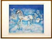
60: Salvador Dali (1904-1989), Lithograph