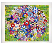
25: Takashi Murakami (B.1962), Offset Lithograph

Lee Ufan (B.1936), Lithograph Signed (lower right), Information (reverse) Image Size: 5 1/8 by 3 1/2 in. (13 by 8cm.) All measurements are approximate. Lee Ufan is a South Korean painter and sculptor who has been active since the 1960s. He is best known for his minimalist and conceptual art, which combines elements of Eastern and Western aesthetics. Ufan's work often explores the relationship between humans and nature, and seeks to create a sense of harmony and balance between the two. He is associated with the Mono-ha movement in Japan and has exhibited his work in galleries and museums around the world, including the Guggenheim Museum in New York and the Centre Pompidou in Paris. WE DO NOT GIVE ANY REPRESENTATION, WARRANTY, OR GUARANTEE OR ASSUME ANY LIABILITY OF ANY KIND IN RESPECT OF ANY LOT WITH REGARD TO MERCHANTABILITY, FITNESS FOR A PARTICULAR PURPOSE, DESCRIPTION, SIZE, QUALITY, CONDITION, ATTRIBUTION, AUTHENTICITY, RARITY, IMPORTANCE, MEDIUM, PROVENANCE, EXHIBITION HISTORY, LITERATURE, OR HISTORICAL RELEVANCE.