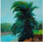
44: Wu Guanzhong (1919-2010), Oil Painting

tool for introspection and for identifying with his experiences in the Black community, as well as attacks on power structures and systems of racism. His visual poetics were acutely political and direct in their criticism of colonialism and support for class struggle. Since Basquiat's death at the age of 27 from a heroin overdose in 1988, his work has steadily increased in value. In 2017, Untitled, a 1982 painting depicting a black skull with red and yellow rivulets, sold for a record-breaking $110.5 million, becoming one of the most expensive paintings ever purchased. WE DO NOT GIVE ANY REPRESENTATION, WARRANTY, OR GUARANTEE OR ASSUME ANY LIABILITY OF ANY KIND IN RESPECT OF ANY LOT WITH REGARD TO MERCHANTABILITY, FITNESS FOR A PARTICULAR PURPOSE, DESCRIPTION, SIZE, QUALITY, CONDITION, ATTRIBUTION, AUTHENTICITY, RARITY, IMPORTANCE, MEDIUM, PROVENANCE, EXHIBITION HISTORY, LITERATURE, OR HISTORICAL RELEVANCE.