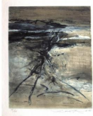
61: Zao Wou-Ki (1920-2013), Lithograph

Salvador Dali (1904-1989), Lithograph Signed (lower right) Image Size: 19 1/8 by 23 1/2 in. (48.5 by 59cm.) All measurements are approximate. Salvador Domingo Felipe Jacinto Dali I Domenech (1904-1989) Dali is one of the greatest surrealists of our time, best known for his ability to translate dreams into artwork, hand painted dream photographs he called them. He was also a sculptor, filmmaker, writer and insane or just wanted people to believe he was insane. He dedicated his life to proving he was a genius. As a child he was often expelled from school. He was afraid of exposing his feet and had an intense fear of grasshoppers. He resided in Spain. WE DO NOT GIVE ANY REPRESENTATION, WARRANTY, OR GUARANTEE OR ASSUME ANY LIABILITY OF ANY KIND IN RESPECT OF ANY LOT WITH REGARD TO MERCHANTABILITY, FITNESS FOR A PARTICULAR PURPOSE, DESCRIPTION, SIZE, QUALITY, CONDITION, ATTRIBUTION, AUTHENTICITY, RARITY, IMPORTANCE, MEDIUM, PROVENANCE, EXHIBITION HISTORY, LITERATURE, OR HISTORICAL RELEVANCE.