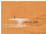
21: Claude Monet (1840-1926), Sketch on Paper