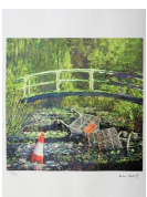
70: Banksy (B.1974), Silkscreen Print