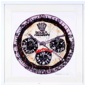
56: Takashi Murakami (B.1962), Offset Lithograph