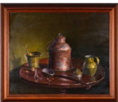
42: John Opie (1761-1807), Oil Painting

Amedeo Modigliani (1884-1920), Lithograph Signed (lower right) by Amedeo Modigliani's Daughter Image Size: 25 1/2 by 19 in. (64 by 47cm.) All measurements are approximate. Amedeo Modigliani (1884-1920) was an Italian painter and sculptor known for his elongated, elegant portraits and nudes. His unique style, blending African and European influences, set him apart from his contemporaries. Despite battling poverty and illness, Modigliani's work left a lasting impact on the art world. WE DO NOT GIVE ANY REPRESENTATION, WARRANTY, OR GUARANTEE OR ASSUME ANY LIABILITY OF ANY KIND IN RESPECT OF ANY LOT WITH REGARD TO MERCHANTABILITY, FITNESS FOR A PARTICULAR PURPOSE, DESCRIPTION, SIZE, QUALITY, CONDITION, ATTRIBUTION, AUTHENTICITY, RARITY, IMPORTANCE, MEDIUM, PROVENANCE, EXHIBITION HISTORY, LITERATURE, OR HISTORICAL RELEVANCE.