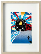
37: Tadanori Yokoo (B.1936), Lithograph

Edmond Lebel (1834-1908), Oil Painting on Panel Signed (lower left) Frame Size: 20 by 24 in. (50 by 60.5cm.) All measurements are approximate. Edmond Lebel (1834-1908) was a French painter known for his Orientalist style. He was born in Paris, France and studied art under the painter Leon Cogniet. Lebel's paintings often depicted scenes of life in North Africa and the Middle East, such as marketplaces, mosques, and street scenes. He was a member of the Societe des Artistes Francais and exhibited regularly at the Salon. Lebel's work was highly regarded for its attention to detail and accuracy in depicting the culture and daily life of the regions he painted. He died in Paris in 1908, leaving behind a legacy as one of France's foremost Orientalist painters. WE DO NOT GIVE ANY REPRESENTATION, WARRANTY, OR GUARANTEE OR ASSUME ANY LIABILITY OF ANY KIND IN RESPECT OF ANY LOT WITH REGARD TO MERCHANTABILITY, FITNESS FOR A PARTICULAR PURPOSE, DESCRIPTION, SIZE, QUALITY, CONDITION, ATTRIBUTION, AUTHENTICITY, RARITY, IMPORTANCE, MEDIUM, PROVENANCE, EXHIBITION HISTORY, LITERATURE, OR HISTORICAL RELEVANCE.