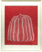
84: Yayoi Kusama (B.1929), Silkscreen Print