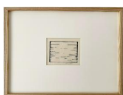
24: Lee Ufan (B.1936), Lithograph

Vincent Van Gogh (1853-1890), Oil Painting Signed (lower left) Image Size: 27 by 19 in. (68 by 48cm.) All measurements are approximate. Vincent van Gogh, in full Vincent Willem van Gogh, (born March 30, 1853, Zundert, Netherlands-died July 29, 1890, Auvers-sur-Oise, near Paris, France), Dutch painter, generally considered the greatest after Rembrandt van Rijn, and one of the greatest of the Post-Impressionists. The striking colour, emphatic brushwork, and contoured forms of his work powerfully influenced the current of Expressionism in modern art. Van Gogh's art became astoundingly popular after his death, especially in the late 20th century, when his work sold for record-breaking sums at auctions around the world and was featured in blockbuster touring exhibitions. In part because of his extensive published letters, van Gogh has also been mythologized in the popular imagination as the quintessential tortured artist. WE DO NOT GIVE ANY REPRESENTATION, WARRANTY, OR GUARANTEE OR ASSUME ANY LIABILITY OF ANY KIND IN RESPECT OF ANY LOT WITH REGARD TO MERCHANTABILITY, FITNESS FOR A PARTICULAR PURPOSE, DESCRIPTION, SIZE, QUALITY, CONDITION, ATTRIBUTION, AUTHENTICITY, RARITY, IMPORTANCE, MEDIUM, PROVENANCE, EXHIBITION HISTORY, LITERATURE, OR HISTORICAL RELEVANCE.