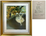
81: Edgar Degas (1834-1917), Lithograph

Nara Yoshitomo (B. 1959), Lithograph Signed (lower right) Image Size: 22 1/8 by 28 in. (56 by 70cm.) All measurements are approximate. Yoshitomo Nara (born 5 December 1959 in Hirosaki, Aomori Prefecture, Japan) is a Japanese artist. He lives and works in Nasushiobara, Tochigi Prefecture, though his artwork has been exhibited worldwide. Nara has had nearly 40 solo exhibitions since 1984. His art work has been housed at the MoMA and the Museum of Contemporary Art, Los Angeles (LACMA). His most well-known and repeated subject is a young girl with piercing eyes. WE DO NOT GIVE ANY REPRESENTATION, WARRANTY, OR GUARANTEE OR ASSUME ANY LIABILITY OF ANY KIND IN RESPECT OF ANY LOT WITH REGARD TO MERCHANTABILITY, FITNESS FOR A PARTICULAR PURPOSE, DESCRIPTION, SIZE, QUALITY, CONDITION, ATTRIBUTION, AUTHENTICITY, RARITY, IMPORTANCE, MEDIUM, PROVENANCE, EXHIBITION HISTORY, LITERATURE, OR HISTORICAL RELEVANCE.