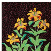
91: Yayoi Kusama (B.1929), Silkscreen Print