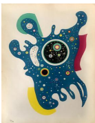
51: Vasily Kandinsky (1866-1944), Lithograph