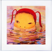
26: Yoshitomo Nara (B.1959), Lithograph