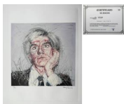
7: Zeng Fanzhi (B. 1964), Silkscreen Print

Zeng Fanzhi (B. 1964), Silkscreen Print Signed (lower right), with Certificate Image Size: 15 by 11 1/8 in. (38 by 28cm.) All measurements are approximate. Zeng Fanzhi (b. 1964) established himself in the 1990s as a highly successful figure painter, best known for his representations of people wearing masks that both conceal and project the indeterminate identities of young Chinese city dwellers. Since about 2004, however, landscape has been the central focus of his art. His oil paintings in this genre, often several meters wide, now occupy a place among the most distinctive and powerfully expressive works. . . . . WE DO NOT GIVE ANY REPRESENTATION, WARRANTY, OR GUARANTEE OR ASSUME ANY LIABILITY OF ANY KIND IN RESPECT OF ANY LOT WITH REGARD TO MERCHANTABILITY, FITNESS FOR A PARTICULAR PURPOSE, DESCRIPTION, SIZE, QUALITY, CONDITION, ATTRIBUTION, AUTHENTICITY, RARITY, IMPORTANCE, MEDIUM, PROVENANCE, EXHIBITION HISTORY, LITERATURE, OR HISTORICAL RELEVANCE.