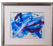
17: Kazuo Shiraga (1924-2008), Gouache Painting

Kees van Dongen (1877-1968), Oil Painting Signed (upper right) Image Size: 22 by 18 in. (55 by 45cm.) All measurements are approximate. Kees van Dongen (1877-1968) was a prominent Dutch painter and key member of the French Fauvist movement, celebrated for his vibrant colors and bold lines. Van Dongen's work focused on urban life and social scenes, particularly female portraiture. His unique style and daring use of color left a lasting impact on early 20th-century modern art. WE DO NOT GIVE ANY REPRESENTATION, WARRANTY, OR GUARANTEE OR ASSUME ANY LIABILITY OF ANY KIND IN RESPECT OF ANY LOT WITH REGARD TO MERCHANTABILITY, FITNESS FOR A PARTICULAR PURPOSE, DESCRIPTION, SIZE, QUALITY, CONDITION, ATTRIBUTION, AUTHENTICITY, RARITY, IMPORTANCE, MEDIUM, PROVENANCE, EXHIBITION HISTORY, LITERATURE, OR HISTORICAL RELEVANCE.