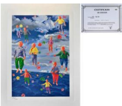
87: Fang Lijun (B.1963), Silkscreen Print

Amedeo Modigliani (1884-1920), Lithograph Signed (lower right) by Amedeo Modigliani's Daughter Image Size: 26 1/2 by 33 1/8 in. (67 by 84cm.) All measurements are approximate. Amedeo Modigliani (1884-1920) was an Italian painter and sculptor known for his elongated, elegant portraits and nudes. His unique style, blending African and European influences, set him apart from his contemporaries. Despite battling poverty and illness, Modigliani's work left a lasting impact on the art world. WE DO NOT GIVE ANY REPRESENTATION, WARRANTY, OR GUARANTEE OR ASSUME ANY LIABILITY OF ANY KIND IN RESPECT OF ANY LOT WITH REGARD TO MERCHANTABILITY, FITNESS FOR A PARTICULAR PURPOSE, DESCRIPTION, SIZE, QUALITY, CONDITION, ATTRIBUTION, AUTHENTICITY, RARITY, IMPORTANCE, MEDIUM, PROVENANCE, EXHIBITION HISTORY, LITERATURE, OR HISTORICAL RELEVANCE.