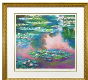
65: Claude Monet (1840-1926), Lithograph