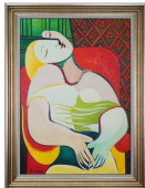
62: Pablo Ruiz Picasso (1881-1973), Oil Painting