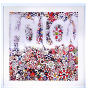
14: Takashi Murakami (B.1962), Offset Lithograph

Le Pho (1907-2001), Oil Painting Signed (lower left) Image Size: 17 1/2 by 14 1/2 in. (44 by 36cm.) All measurements are approximate. French-Vietnamese painter Le Pho, an impressionist and surrealist artist, is one of the most prominent Vietnamese artists of the twentieth century and one of the most sought-after artists in Southeast Asia today. Le Pho studied in Paris and spent most of his life in France. He studied with Victor Tardieu, a friend and companion of Henri Matisse. He was one of four EBAl graduates to pursue a career in Paris, including Mai TrungTh, VCaoam and the female painter LeThLu. His artworks have been exhibited in Paris, Lyon, Nice and Rouen, as well as in Europe in Brussels and New York, Morocco. His paintings successfully blend Impressionism, Surrealism and traditional Chinese painting, synthesizing Eastern symbols with Western aesthetics in a poetic and romantic way. WE DO NOT GIVE ANY REPRESENTATION, WARRANTY, OR GUARANTEE OR ASSUME ANY LIABILITY OF ANY KIND IN RESPECT OF ANY LOT WITH REGARD TO MERCHANTABILITY, FITNESS FOR A PARTICULAR PURPOSE, DESCRIPTION, SIZE, QUALITY, CONDITION, ATTRIBUTION, AUTHENTICITY, RARITY, IMPORTANCE, MEDIUM, PROVENANCE, EXHIBITION HISTORY, LITERATURE, OR HISTORICAL RELEVANCE.