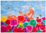
75: Fang Lijun (B.1963), Silkscreen Print

Andre Masson (1896-1987), Lithograph Signed (lower left) Image Size: 14 by 10 1/8 in. (35.5 by 25.5cm.) All measurements are approximate. Andre Masson (1896-1987) was a French painter and graphic artist who is associated with the Surrealist movement. He served in World War I and was injured, which greatly influenced his work. Masson's early works were influenced by Cubism and Fauvism, but he became involved in Surrealism in the 1920s. His works often featured organic forms and imagery that explored the unconscious mind. Masson's technique involved using automatic drawing, a process in which the artist allows their hand to move freely across the paper without conscious control, in order to tap into the subconscious. During World War II, Masson fled to the United States, where he continued to work and became associated with the Abstract Expressionist movement. He later returned to France and continued to create art until his death. Today, Masson's works are held in major museum collections around the world, and he is regarded as one of the most important Surrealist artists of the 20th century. WE DO NOT GIVE ANY REPRESENTATION, WARRANTY, OR GUARANTEE OR ASSUME ANY LIABILITY OF ANY KIND IN RESPECT OF ANY LOT WITH REGARD TO MERCHANTABILITY, FITNESS FOR A PARTICULAR PURPOSE, DESCRIPTION, SIZE, QUALITY, CONDITION, ATTRIBUTION, AUTHENTICITY, RARITY, IMPORTANCE, MEDIUM, PROVENANCE, EXHIBITION HISTORY, LITERATURE, OR HISTORICAL RELEVANCE.