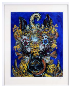
52: Miwa Komatsu (B.1984), Lithograph