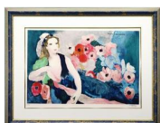
8: Marie Laurencin (1883-1956), Lithograph

Zeng Fanzhi (B. 1964), Silkscreen Print Signed (lower right), with Certificate Image Size: 15 by 11 1/8 in. (38 by 28cm.) All measurements are approximate. Zeng Fanzhi (b. 1964) established himself in the 1990s as a highly successful figure painter, best known for his representations of people wearing masks that both conceal and project the indeterminate identities of young Chinese city dwellers. Since about 2004, however, landscape has been the central focus of his art. His oil paintings in this genre, often several meters wide, now occupy a place among the most distinctive and powerfully expressive works. . . . . WE DO NOT GIVE ANY REPRESENTATION, WARRANTY, OR GUARANTEE OR ASSUME ANY LIABILITY OF ANY KIND IN RESPECT OF ANY LOT WITH REGARD TO MERCHANTABILITY, FITNESS FOR A PARTICULAR PURPOSE, DESCRIPTION, SIZE, QUALITY, CONDITION, ATTRIBUTION, AUTHENTICITY, RARITY, IMPORTANCE, MEDIUM, PROVENANCE, EXHIBITION HISTORY, LITERATURE, OR HISTORICAL RELEVANCE.