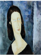
41: Amedeo Modigliani (1884-1920), Lithograph

Paul Cezanne (1839-1906), Lithograph Signed (lower right) Image Size: 18 1/8 by 24 in. (46 by 60cm.) All measurements are approximate. Paul Cezanne (January 19, 1839 - October 22, 1906) was a French Post-Impressionist painter. His work and ideas influenced many 20th century artists and art movements, especially the Cubists. For most of his lifetime, his art was not understood or accepted by the public. Through his persistence, it eventually challenged all conventional 19th century painting values. Cezanne's greatest achievement was his unprecedentedly incisive analysis of color and light and darkness, which overturned previous points of visual perspective and removed the construction of space from the impression of mixed color, making the field of painting officially pure art in a way that no previous school of painting had been able to do. For this reason, he is known as the "Father of Modern Art". WE DO NOT GIVE ANY REPRESENTATION, WARRANTY, OR GUARANTEE OR ASSUME ANY LIABILITY OF ANY KIND IN RESPECT OF ANY LOT WITH REGARD TO MERCHANTABILITY, FITNESS FOR A PARTICULAR PURPOSE, DESCRIPTION, SIZE, QUALITY, CONDITION, ATTRIBUTION, AUTHENTICITY, RARITY, IMPORTANCE, MEDIUM, PROVENANCE, EXHIBITION HISTORY, LITERATURE, OR HISTORICAL RELEVANCE.