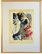
79: Nara Yoshitomo (B. 1959), Lithograph

Michel de Gallard (1921-2007), Oil Painting Signed (lower left) Image Size: 36 by 23 1/2 in. (90.5 by 59cm.) All measurements are approximate. Michel de Gallard (1921-2007) was a French painter known for his abstract expressionist works. His pieces were often large, colorful oil paintings with geometric shapes and bold brushstrokes, full of dynamism and energy. His artistic style was deeply influenced by modernism and postmodernism, as well as by his own travels and interest in world culture. His works were exhibited in multiple museums and galleries across Europe and the United States, and received wide acclaim and recognition. WE DO NOT GIVE ANY REPRESENTATION, WARRANTY, OR GUARANTEE OR ASSUME ANY LIABILITY OF ANY KIND IN RESPECT OF ANY LOT WITH REGARD TO MERCHANTABILITY, FITNESS FOR A PARTICULAR PURPOSE, DESCRIPTION, SIZE, QUALITY, CONDITION, ATTRIBUTION, AUTHENTICITY, RARITY, IMPORTANCE, MEDIUM, PROVENANCE, EXHIBITION HISTORY, LITERATURE, OR HISTORICAL RELEVANCE.