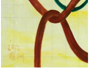
48: Zhang Enli (B.1965), Lithograph