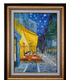
23: Vincent Van Gogh (1853-1890), Oil Painting

Unknown Author, Oil Painting Signed (lower right) Image Size: 22 by 17 1/2 in. (55 by 44cm.) All measurements are approximate. WE DO NOT GIVE ANY REPRESENTATION, WARRANTY, OR GUARANTEE OR ASSUME ANY LIABILITY OF ANY KIND IN RESPECT OF ANY LOT WITH REGARD TO MERCHANTABILITY, FITNESS FOR A PARTICULAR PURPOSE, DESCRIPTION, SIZE, QUALITY, CONDITION, ATTRIBUTION, AUTHENTICITY, RARITY, IMPORTANCE, MEDIUM, PROVENANCE, EXHIBITION HISTORY, LITERATURE, OR HISTORICAL RELEVANCE.