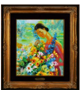
13: Le Pho (1907-2001), Oil Painting