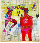
35: Jean-Michel Basquiat (1960-1988), Acrylic Painting