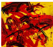
20: Kazuo Shiraga (1924-2008), Oil Painting

Yoshitomo Nara (B.1959), Acrylic Painting Signed (reverse) Image Size: 24 1/2 by 20 1/8 in. (62 by 51cm.) All measurements are approximate. Yoshitomo Nara (B. 1959) is a Japanese artist. He lives and works in Nasushiobara, Tochigi Prefecture, though his artwork has been exhibited worldwide. Nara has had nearly 40 solo exhibitions since 1984. His art work has been housed at the MoMA and the Museum of Contemporary Art, Los Angeles (LACMA). His most well-known and repeated subject is a young girl with piercing eyes. WE DO NOT GIVE ANY REPRESENTATION, WARRANTY, OR GUARANTEE OR ASSUME ANY LIABILITY OF ANY KIND IN RESPECT OF ANY LOT WITH REGARD TO MERCHANTABILITY, FITNESS FOR A PARTICULAR PURPOSE, DESCRIPTION, SIZE, QUALITY, CONDITION, ATTRIBUTION, AUTHENTICITY, RARITY, IMPORTANCE, MEDIUM, PROVENANCE, EXHIBITION HISTORY, LITERATURE, OR HISTORICAL RELEVANCE.