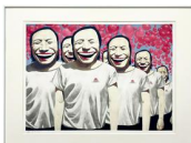
58: Yue Minjun (B.1962), Lithograph

Egon Leo Adolf Ludwig Schiele (1890-1918), Silkscreen Print Stamped, with Certificate Image Size: 15 by 11 1/8 in. (38 by 28cm.) All measurements are approximate. Egon Leo Adolf Ludwig Schiele (1890-1918) was an Austrian Expressionist painter. Gustav Klimt, figurative painter of the early 20th century, was a mentor. His work is noted for its intensity and its raw sexuality, and the many self-portraits the artist produced, including nude self-portraits. The twisted body shapes and the expressive line that characterize Schiele's paintings and drawings mark the artist as an early exponent of Expressionism. WE DO NOT GIVE ANY REPRESENTATION, WARRANTY, OR GUARANTEE OR ASSUME ANY LIABILITY OF ANY KIND IN RESPECT OF ANY LOT WITH REGARD TO MERCHANTABILITY, FITNESS FOR A PARTICULAR PURPOSE, DESCRIPTION, SIZE, QUALITY, CONDITION, ATTRIBUTION, AUTHENTICITY, RARITY, IMPORTANCE, MEDIUM, PROVENANCE, EXHIBITION HISTORY, LITERATURE, OR HISTORICAL RELEVANCE.