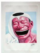
69: Yue Minjun (B.1962), Silkscreen Print