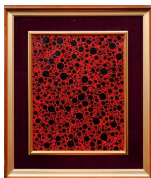
55: Yayoi Kusama (B.1929), Acrylic Painting