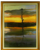
83: Chukasin (B.1960), Oil Painting

Jean-Claude Chesnay, Oil Painting Signed (lower right) Image Size: 16 1/8 by 24 in. (40.9 by 60.6cm.) All measurements are approximate. French painter Jean-Claude Chesnay is celebrated for his unique artistic style that merges Romanticism and Realism. His captivating works depict people, landscapes, and still lifes with delicate brushstrokes, vivid colors, and expressive emotional depth. Chesnay's art has garnered international attention and recognition within the art world, captivating audiences with its striking beauty and distinct aesthetic. WE DO NOT GIVE ANY REPRESENTATION, WARRANTY, OR GUARANTEE OR ASSUME ANY LIABILITY OF ANY KIND IN RESPECT OF ANY LOT WITH REGARD TO MERCHANTABILITY, FITNESS FOR A PARTICULAR PURPOSE, DESCRIPTION, SIZE, QUALITY, CONDITION, ATTRIBUTION, AUTHENTICITY, RARITY, IMPORTANCE, MEDIUM, PROVENANCE, EXHIBITION HISTORY, LITERATURE, OR HISTORICAL RELEVANCE.