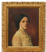
16: Kees van Dongen (1877-1968), Oil Painting