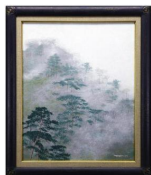
64: Takatoshi Yamasaki (B.1944), Oil Painting