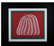
15: Yayoi Kusama (B.1929), Silkscreen Print

Takashi Murakami (B.1962), Offset Lithograph Signed (lower right) Image Size: 26 1/2 by 26 in. (66.5 by 66cm.) All measurements are approximate. Takashi Murakami (B. 1962) is a Japanese contemporary artist. He works in fine arts media (such as painting and sculpture) as well as commercial (such as fashion, merchandise, and animation) and is known for blurring the line between high and low arts as well as co aesthetic characteristics of the Japanese artistic tradition and the nature of postwar Japanese culture and society, and is also used for Murakami's artistic style and other Japanese artists he has influenced. WE DO NOT GIVE ANY REPRESENTATION, WARRANTY, OR GUARANTEE OR ASSUME ANY LIABILITY OF ANY KIND IN RESPECT OF ANY LOT WITH REGARD TO MERCHANTABILITY, FITNESS FOR A PARTICULAR PURPOSE, DESCRIPTION, SIZE, QUALITY, CONDITION, ATTRIBUTION, AUTHENTICITY, RARITY, IMPORTANCE, MEDIUM, PROVENANCE, EXHIBITION HISTORY, LITERATURE, OR HISTORICAL RELEVANCE.