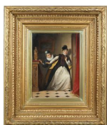
89: Jean-Baptiste Greuze (1725-1805), Oil Painting