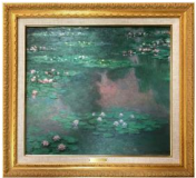
28: Claude Monet (1840-1926), Oil Painting