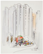
45: Wu Guanzhong (1919-2010), Ink with Watercolor on Paper