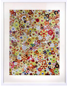
49: Takashi Murakami (B.1962), Offset Lithograph

Zhang Enli (B.1965), Lithograph Signed (lower left) Image Size: 39 by 31 1/8 in. (98 by 79cm.) All measurements are approximate. Zhang Enli (B. 1965) is a contemporary Chinese artist known for his distinctive style that merges abstraction and representation. His works often feature ordinary objects and scenes, such as empty rooms or everyday utensils, rendered in a loose and expressive manner. Zhang's paintings explore themes of memory, perception, and the passage of time, and often convey a sense of melancholy and nostalgia. His work has been exhibited in galleries and museums around the world, including the Shanghai Art Museum, the San Francisco Museum of Modern Art, and the Museum of Contemporary Art in Tokyo. Today, he is recognized as one of China's leading contemporary artists. WE DO NOT GIVE ANY REPRESENTATION, WARRANTY, OR GUARANTEE OR ASSUME ANY LIABILITY OF ANY KIND IN RESPECT OF ANY LOT WITH REGARD TO MERCHANTABILITY, FITNESS FOR A PARTICULAR PURPOSE, DESCRIPTION, SIZE, QUALITY, CONDITION, ATTRIBUTION, AUTHENTICITY, RARITY, IMPORTANCE, MEDIUM, PROVENANCE, EXHIBITION HISTORY, LITERATURE, OR HISTORICAL RELEVANCE.