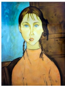
86: Amedeo Modigliani (1884-1920), Lithograph