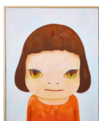
19: Yoshitomo Nara (B.1959), Acrylic Painting

Takashi Murakami (B.1962), Offset Lithograph Signed (lower right) Image Size: 23 1/2 by 23 1/2 in. (59 by 59cm.) All measurements are approximate. Takashi Murakami (B. 1962) is a Japanese contemporary artist. He works in fine arts media (such as painting and sculpture) as well as commercial (such as fashion, merchandise, and animation) and is known for blurring the line between high and low arts as well as co aesthetic characteristics of the Japanese artistic tradition and the nature of postwar Japanese culture and society, and is also used for Murakami's artistic style and other Japanese artists he has influenced. WE DO NOT GIVE ANY REPRESENTATION, WARRANTY, OR GUARANTEE OR ASSUME ANY LIABILITY OF ANY KIND IN RESPECT OF ANY LOT WITH REGARD TO MERCHANTABILITY, FITNESS FOR A PARTICULAR PURPOSE, DESCRIPTION, SIZE, QUALITY, CONDITION, ATTRIBUTION, AUTHENTICITY, RARITY, IMPORTANCE, MEDIUM, PROVENANCE, EXHIBITION HISTORY, LITERATURE, OR HISTORICAL RELEVANCE.