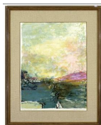
54: Zao Wou-Ki (1920-2013), Lithograph

Hajime Sorayama (B.1947), Offset Lithograph Signed (below), with Certificate Image Size: 19 by 13 1/8 in. (47.5 by 33.3cm.) All measurements are approximate. Hajime Sorayama (Sorayama Hajime, born February 22, 1947) is a Japanese illustrator known, along for his design work on the original Sony AIBO, for his precisely detailed, erotic portrayals of feminine robots. He describes his highly detailed style as "superrealism", which he says "deals with the technical issue of how close one can get to one's object." Sorayama is known for his fine art, illustration, and industrial design. Of the distinction between the first two, Sorayama commented in an interview: "Unlike art, illustration is not a matter of emotion or hatreds, but an experience that comes naturally through logical thinking. "WE DO NOT GIVE ANY REPRESENTATION, WARRANTY, OR GUARANTEE OR ASSUME ANY LIABILITY OF ANY KIND IN RESPECT OF ANY LOT WITH REGARD TO MERCHANTABILITY, FITNESS FOR A PARTICULAR PURPOSE, DESCRIPTION, SIZE, QUALITY, CONDITION, ATTRIBUTION, AUTHENTICITY, RARITY, IMPORTANCE, MEDIUM, PROVENANCE, EXHIBITION HISTORY, LITERATURE, OR HISTORICAL RELEVANCE.